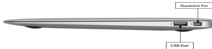
(Fig.5) Right Side View

Note reprinted from "Apple 11-inch MacBook air: Apple MJVM2LL/A 11" MacBook Air (2015) 1.6GHz Dual... at MacSales.com. (n.d.). Retrieved November 6, 2022, from https://eshop.macsales.com/item/Apple/F1FP7XXXXXC/