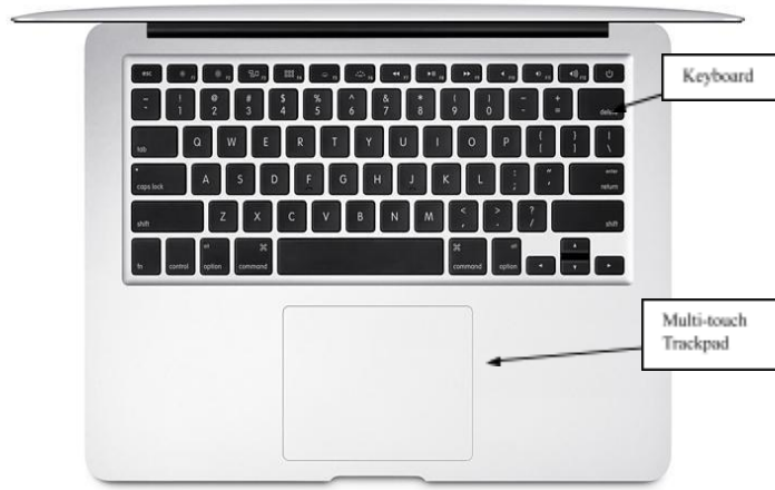
(Fig.4) Top View

Note reprinted from "13-inch macbook air (early 2015) review." Macworld. Retrieved November 6, 2022, from https://www.macworld.com/article/667329/13-inch-macbook-air-early-2015-review.html