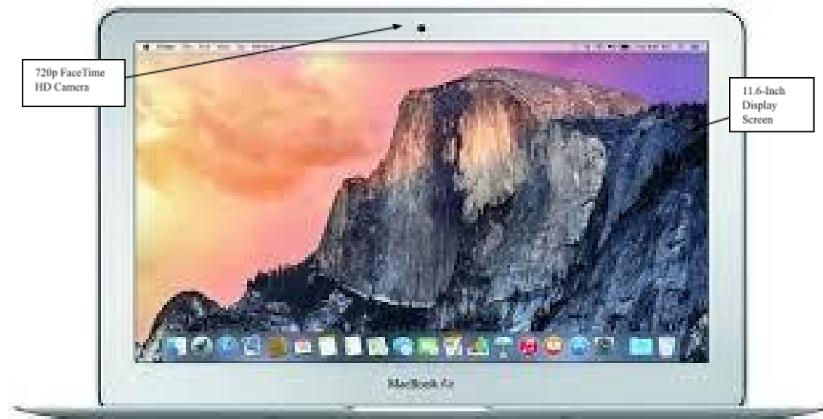
(Fig.3) Front View

Note reprinted from Apple. Official Apple Support. (n.d.). Retrieved November 6, 2022, from https://support.apple.com/kb/SP713?locale=en_US